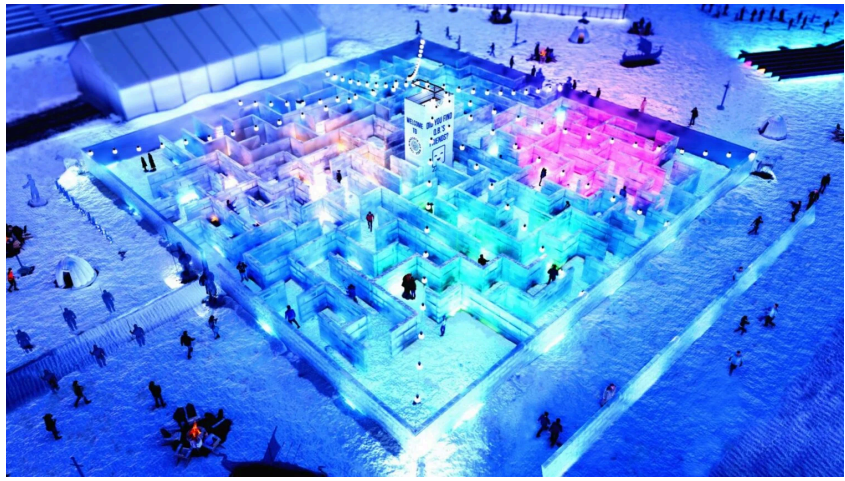
Image of the Winter SKOLstice's ice maze